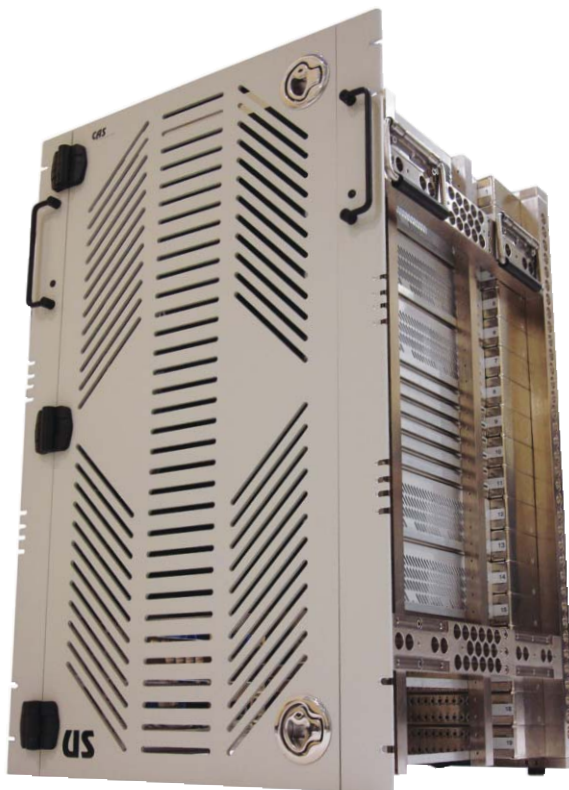
Series G2T-CAS Example of a larger switching "frame" for the G2T-CAS system technology showing the open frame design for excellent cooling and hinged front panel for quick module access.