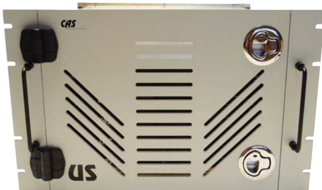
Series G2 - CAS Example front view, 7RU