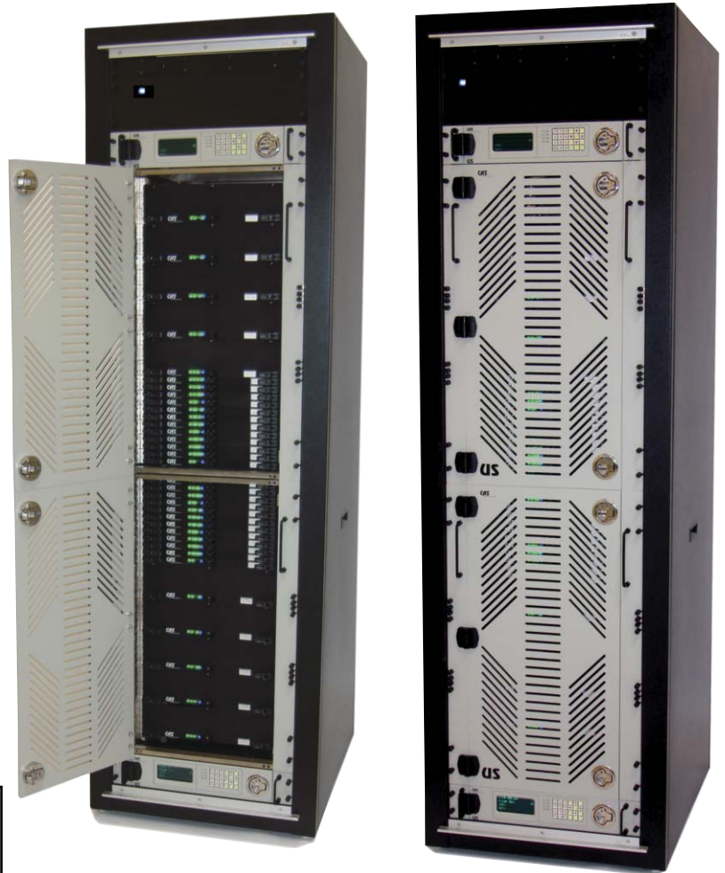
An example of a multi-chassis configuration system with the hinged front panel open exposing the internal hot-swap modules (shows prior controller version with keypad). We can provide total system configuration and installation including racks, software and site installation.