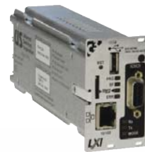
Model C3 Plug-in CPU controller (single or dual can be installed)