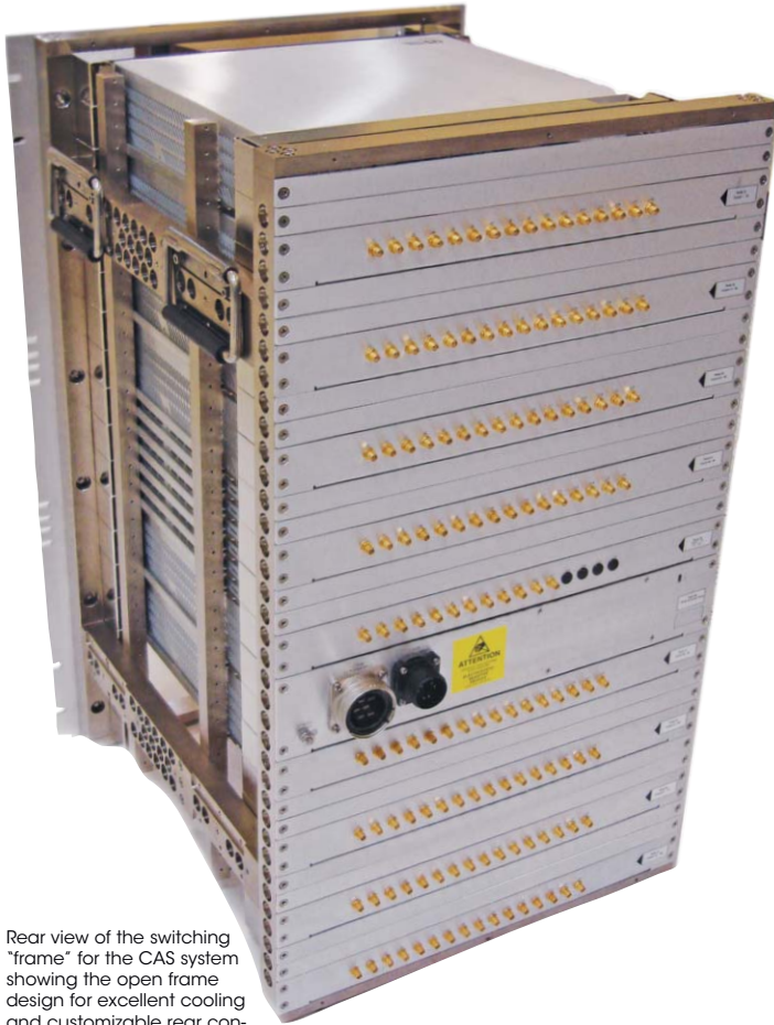
Rear view of the switching "frame" for the CAS system showing the open frame design for excellent cooling and customizable rear connector panel.