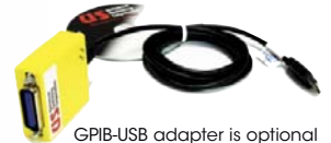
GPIB-USB adapter is optional for legacy applications requiring GPIB control.