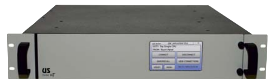
Series G2T-CAS Controller & Powerhead Unit, 2RU